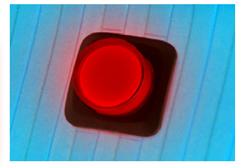
Push button manual alarm

Dependant on transmitter quantity and the connected alarm devices, bus cable lengths of up to 1200m are possible.