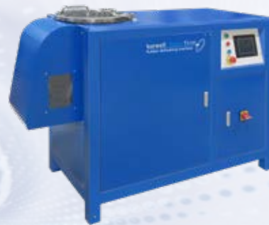
barwell Spin Trim Rubber deflashing machine

It also means that a higher quality part is produced as the cryogenic and media blasting process can concentrate on polishing and fine trimming.