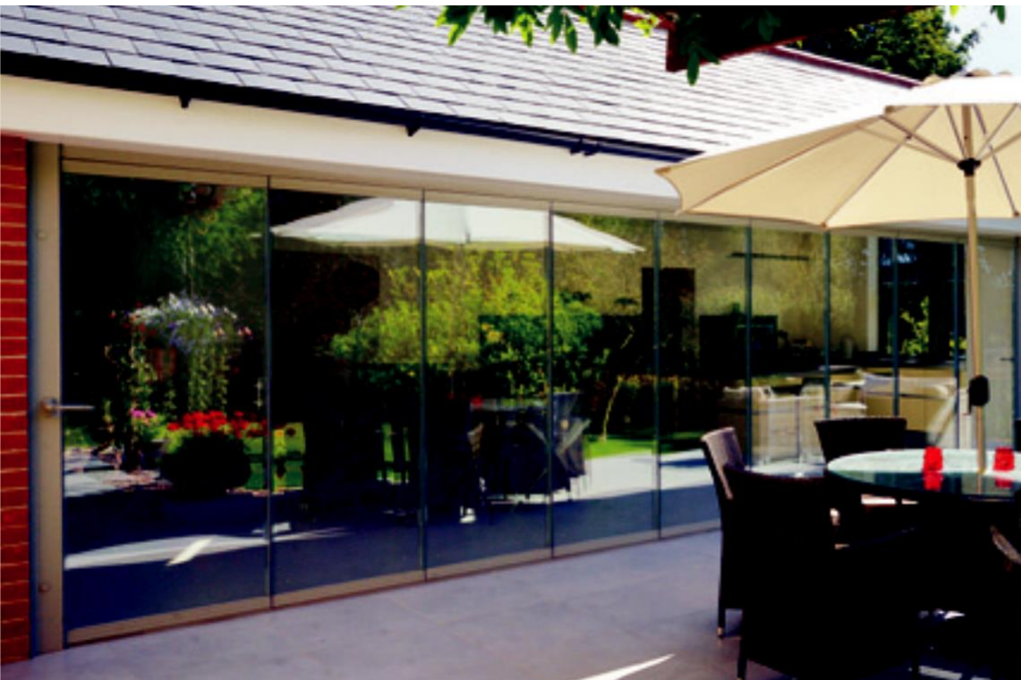
Private residence, Stowmarket