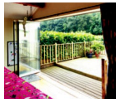
Private residence, Wells