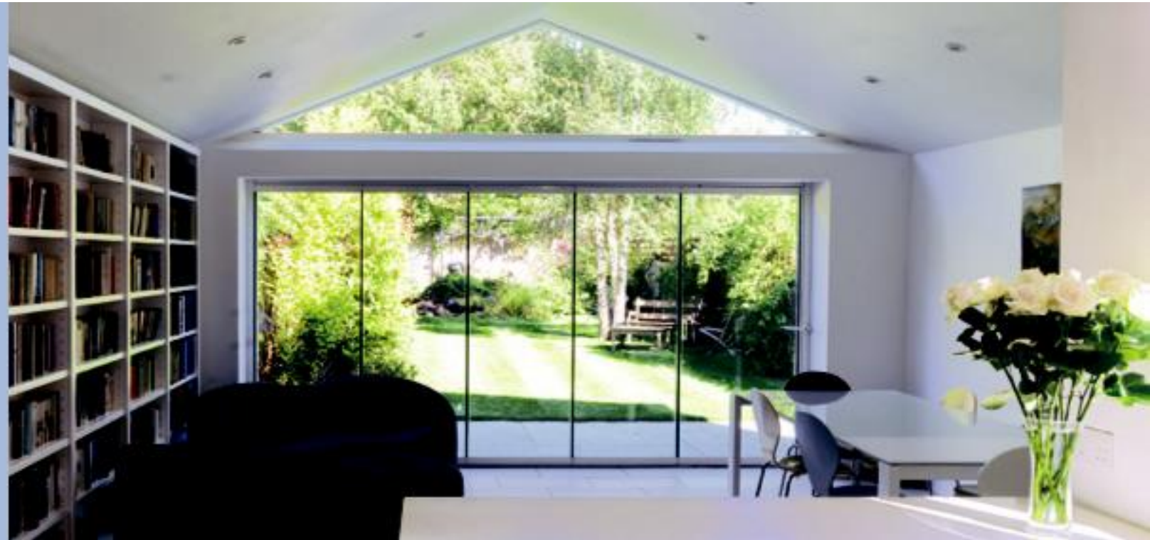
Private residence, Oxford

Clear views come as standard with Frameless glass curtains