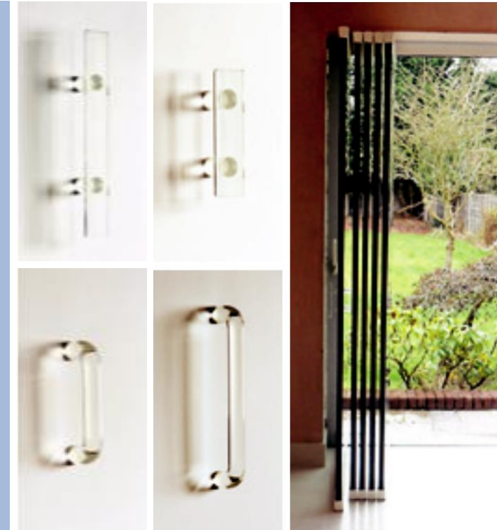
Choice of stylish glass handles

CE certified and comply with all relevant standards including: - BS6375 part 1 2009 - BS EN 1026:2000 for Air Permeability - BS EN 1027:2000 for Water Tightness - BS EN 12211:2000 for Wind Resistance - BS EN 1279-2: for Moisture Penetration in Insulating Glass Units - PAS 24:2012 for Enhanced Security Performance of door sets and windows - BS EN 1279-3 for Gas Leakage and Gas Concentration in Insulated Glass Units