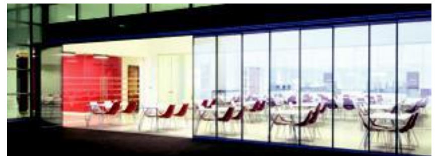
Exterior view of Manchester United's training ground staff restaurant showing double-glazed curtains opening onto viewing balcony