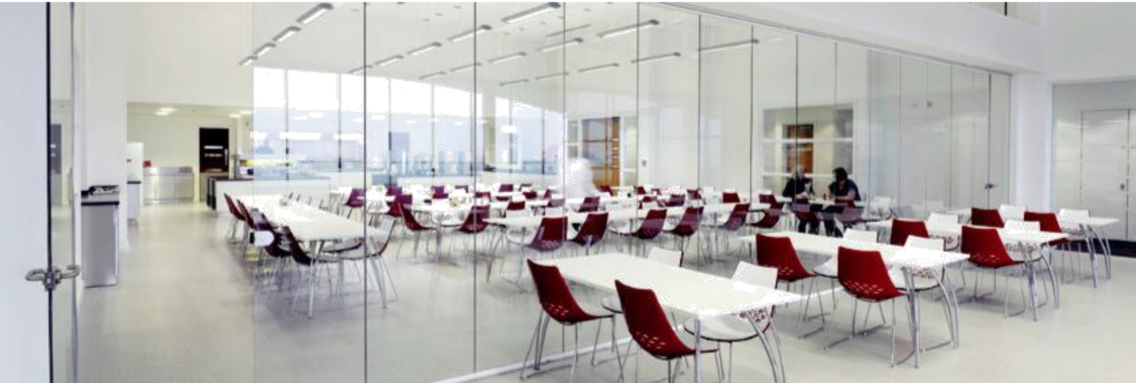
Installation at Manchester United's training ground staff restaurant. 18 single-glazed curtains each measuring 2.9m high x 0.8m wide