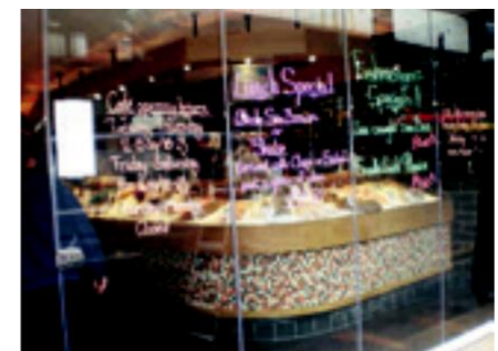
Retail installation, single-glazed