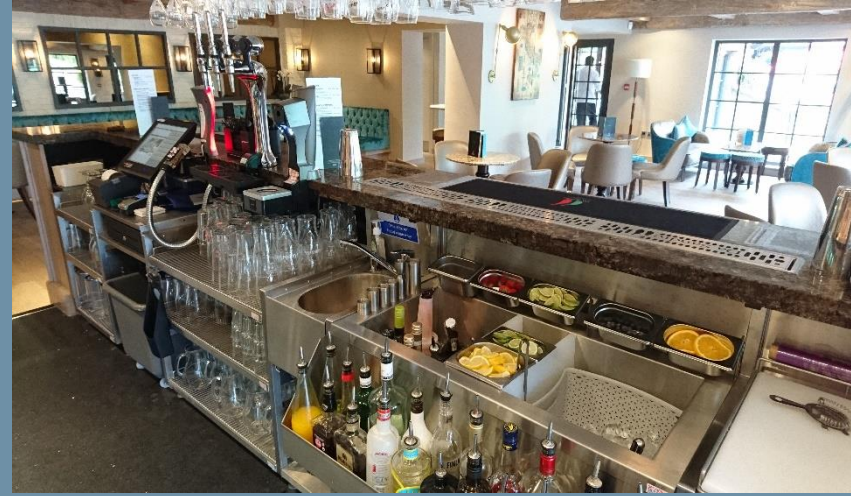
Da Sandro's Huddersfield – Back of Bar