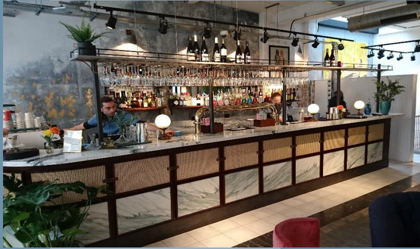
Scarlet Green, London – Customer Facing