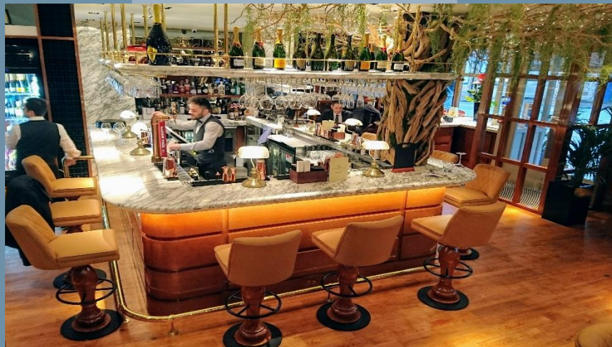
Cibo, Wilmslow – Customer Facing