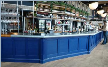
The Oyster Shed, London – Originally installed in 2011, first refit in 2015 and more recently 2018, using Servaclean Refit & Reuse Service