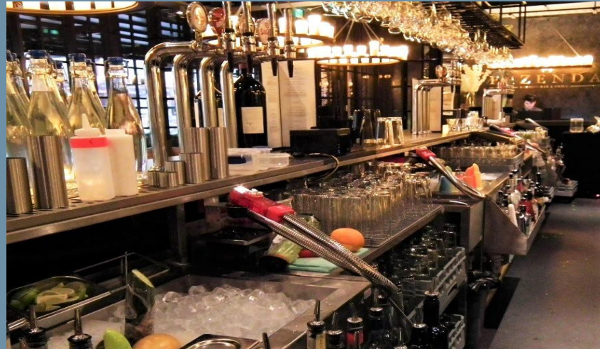
Fazenda, Manchester – Back of Bar