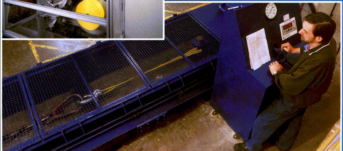
In-house 50,000 kg Test Bed at the Eastbourne factory