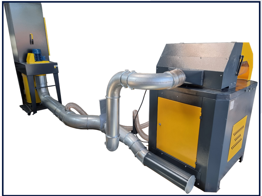
AES - SHOWN FITTED