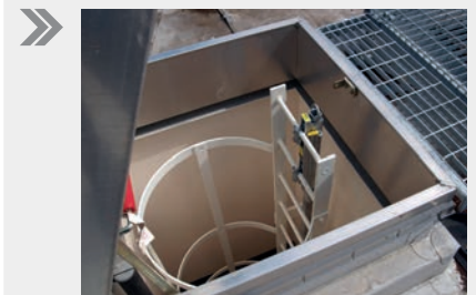
ROOF ACCESS HATCHES