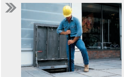
FLOOR ACCESS DOORS