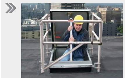
ROOF SAFETY PRODUCTS