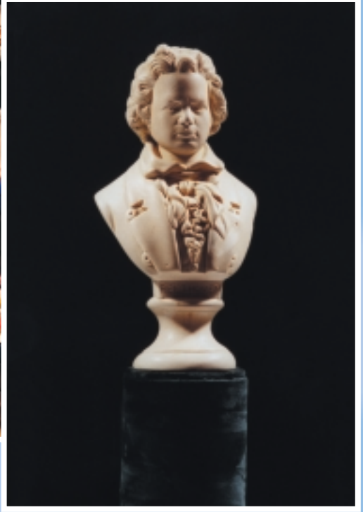
Protecting Single Items