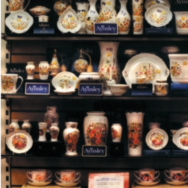
Protecting Multiple Items