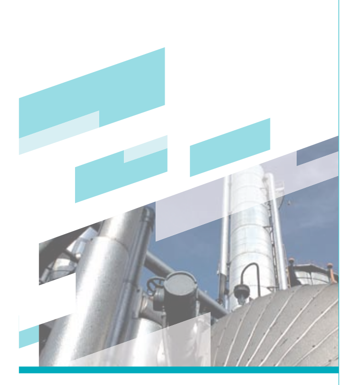
ABB currently offers a comprehensive range of Part Turn and Linear Actuators in standard and Explosion-proof configurations.

In addition, ABB's electronic control units, with control panel, are available in integrated field installation and rack-mounting configurations.