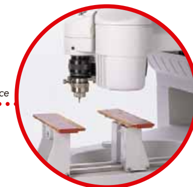
Standard self-centering vice