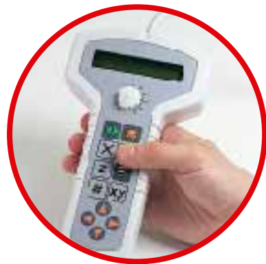
Remote control for engraving functions