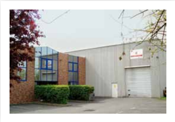
Bondoufle (FRANCE) Special pulleys production.