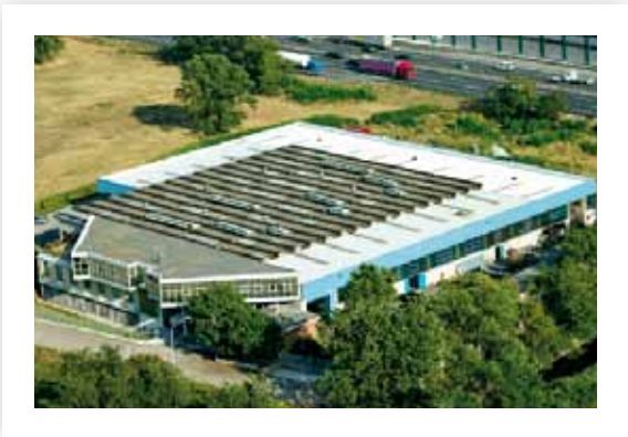
Milan (ITALY) Production plant for standard and special pulleys.