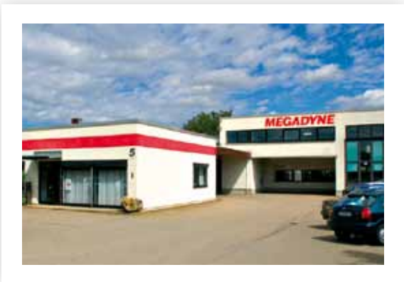
Ulm (GERMANY) Polyurethane and rubber endless flat belts production.

Megadyne commenced manufacturing transmission belts in 1957. Constant research and development has resulted in the creation of a large range of quality products.