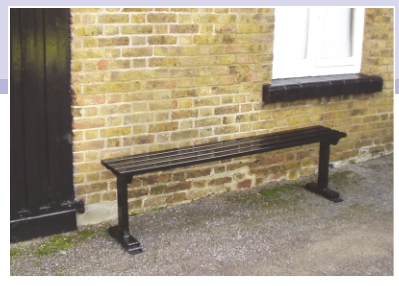
Colour shown is Black RAL 9005.