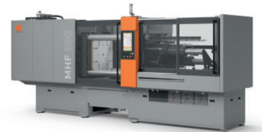
# 1: MHD 700 D / 300 the top seller for the manufacture of sealing ring.