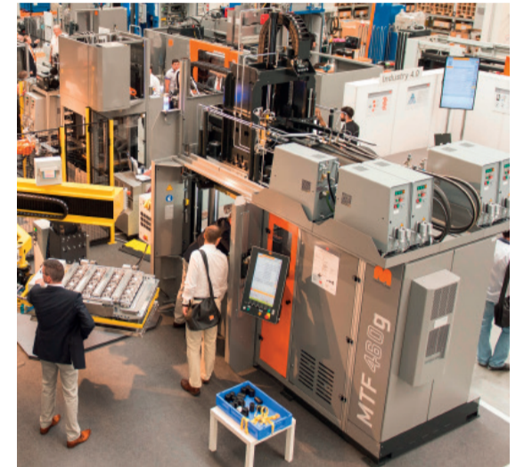
The image shows exhibit 5 – MTF 4000R / 460 G – 4-axis vertical machine with a large-volume plasticising unit positioned on the upper machine plate combined with a vertical injection module.

Exhibit 5 was a production cell based on a 4-axis vertical machine of type MTF 4000R / 460 g with a horizontal large-volume plasticising unit positioned on the upper machine plate combined with a vertical injection module. Before the clamping unit, a “Liftmaster” heavy duty stacker from HAHNAUTOMATION assumed the removal of the cylindrical engine mounts made from a metal/rubber combination, as well as the preheating and insertion of two metal inserts each into the 24-cavity plate of the injection mould.