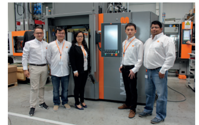
Our top executives bring a lot of experience with them.