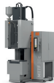
# 2: MTTP85 / 30 C – TPE processing using the proven MAPLAN C-frame technology.