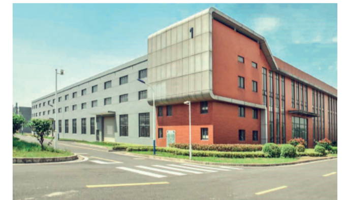
The modern MAPLAN location in the industrial park of Wujin offers every opportunity for a successful start in China.

However, growth in Asia and the US will not happen at the expense of MAPLAN locations in Europe, quite the opposite! An investment of €12 million has been made in the high-tech area in Kottlingbrunn near Vienna. A supplier plant for assemblies is scheduled to go into operation in Slovakia at the beginning of 2018. The Malacky site between Vienna and Bratislava has already been prefabricating control cabinets for MAPLAN since 2015.