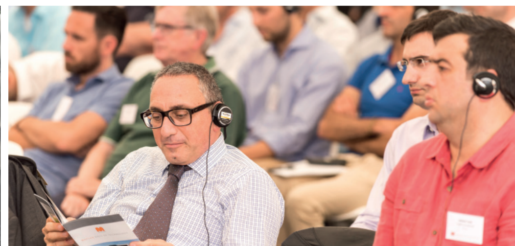
A simultaneous translation allowed all participants to benefit equally from the specialist presentations.

Short, concise presentation on elastomer injection moulding machines in the setting of Industry 4.0 conveyed information between the breaks. The limitation to twelve top speakers ensured a pithy offering. Because each and every presentation we attend must be worth it!