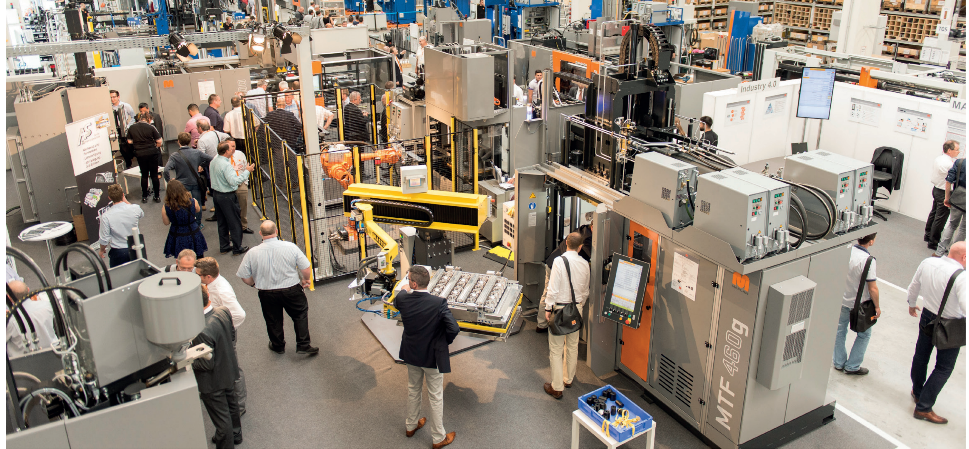
Big rush in the MAPLAN technical centre.