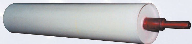
One of the smallest Magnetic Pulleys in the range - 215mm diameter

Dimensions are a guide only. Please ask for certified drawing when ordering.