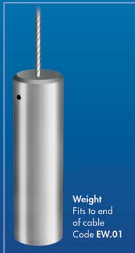
Weight Fits to end of cable Code EW.01