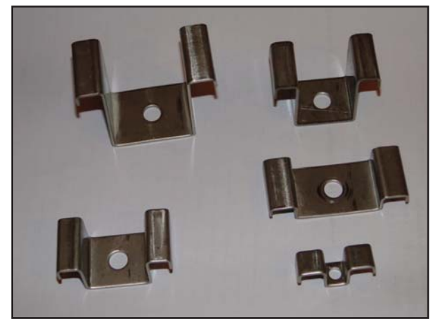
M clips available for 50mm, 38mm, 25mm, 20mm and mini-mesh gratings.

A wide range of stainless steel clips and clamps available from stock for all grating types. Also available are a range of stainless steel and plastic feet which can be used to create raised walkways of varying heights. Clips and clamps come complete with all necessary nuts, bolts and washers.