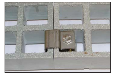
Installed G clamp

Use Mclips to hold grating panels down firmly. Use at least 4 per panel. Use G clamps to join panels together where there is no support. Use at least 2 per panel. Please contact us for a sample.