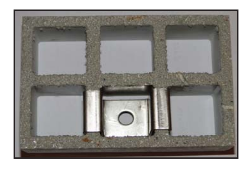
Installed M clip

Use Mclips to hold grating panels down firmly. Use at least 4 per panel. Use G clamps to join panels together where there is no support. Use at least 2 per panel. Please contact us for a sample.