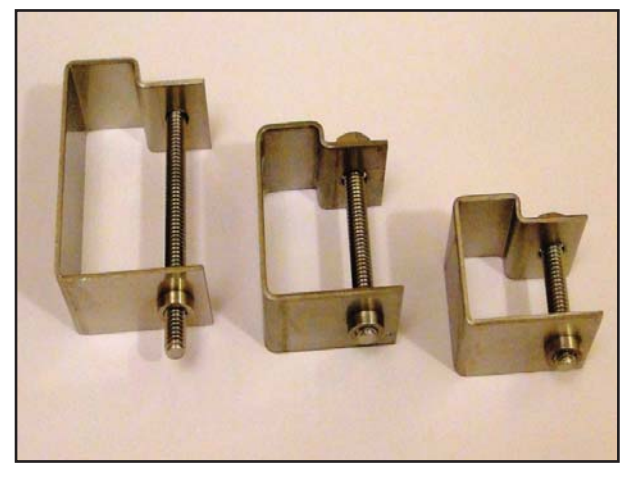
G clamps available for 50mm, 38mm and 25mm thick gratings