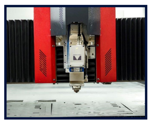
PRECITEC PROCUTTER CUTTING HEAD